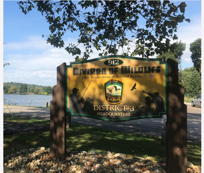
ODNR DISTRICT 3