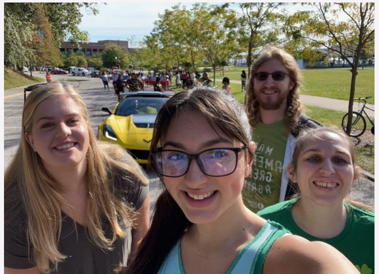
FEPC MEMBERS AT 2021 HOMECOMING PARADE