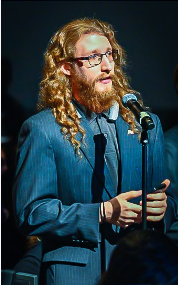
NAACP ENVIRONMENTAL CLIMATE JUSTICE CHAIR.