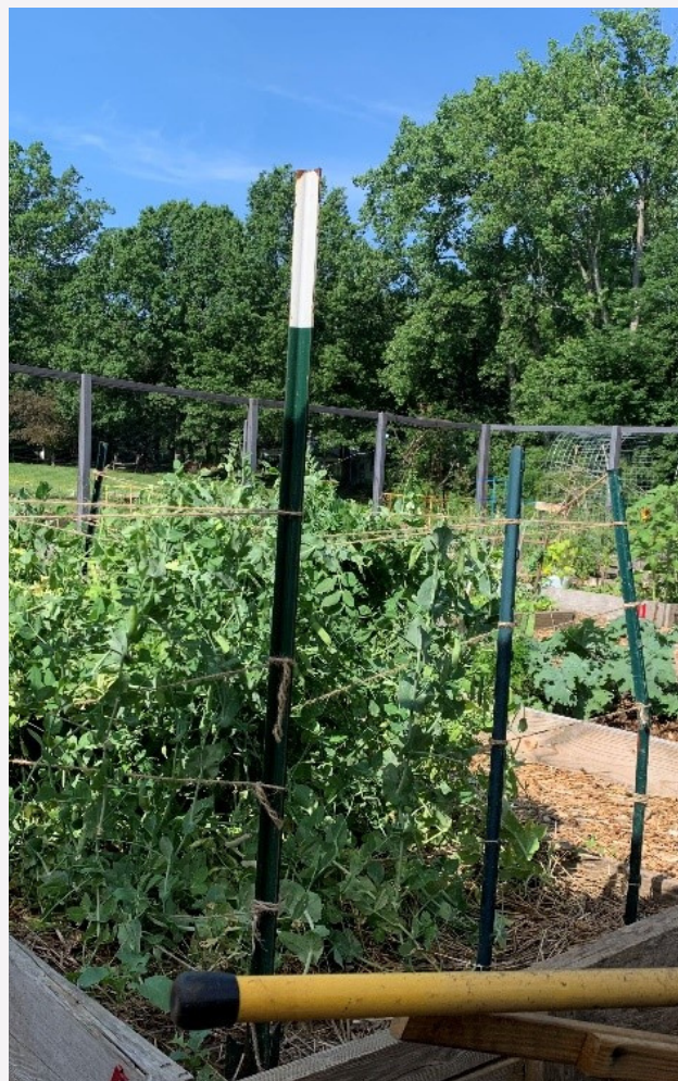
LET'S GROW TOGETHER COALITION IN KENT.

This past summer, I interned with the Let's Grow Together Coalition in Kent. I worked at their community garden at Walls Elementary, but I was also able to run their social media accounts and website. This internship can be really flexible for anyone because the work you do at the garden can be done whenever you're available, and they work with you to ensure you're getting the experience you want. My experience included watering and maintaining the garden, running a few volunteer workdays, as well as researching gardening tips for their social media and event promoting.